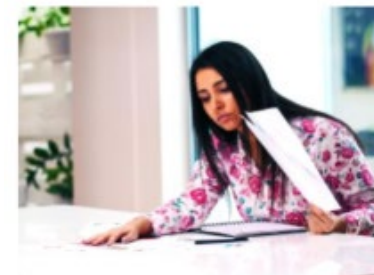
Focus on Peer Review