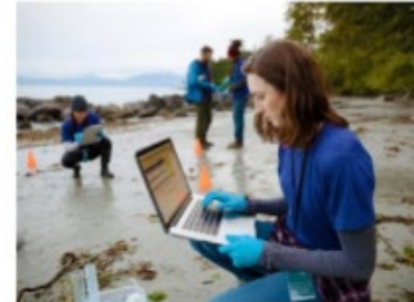
Scientific Writing and Publishing