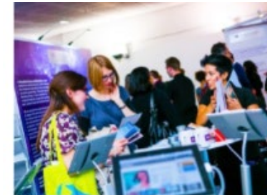
Effective Collaboration in Research